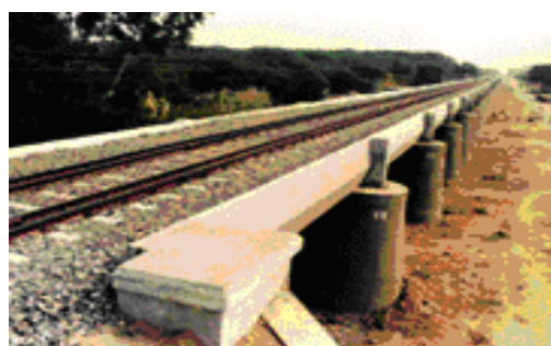
Sabi Bridge, Delhi - Ahmadabad