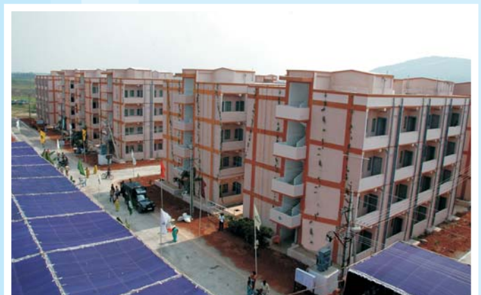
"Houses built under slum upgradation programmes in India"